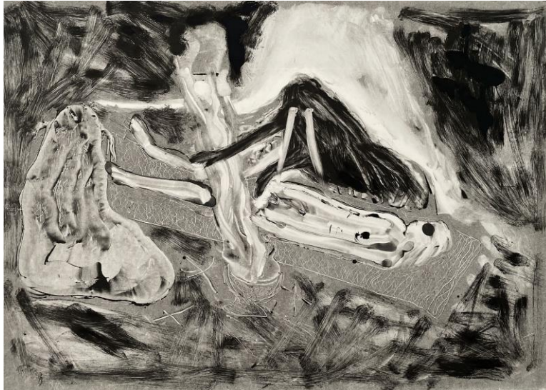
Fig. 6. Santa C. Barraza, Shamanizing-Healing I (from the Dream Series), 1982. Monoprint, black ink on Italia paper, 28 x 20 in. Courtesy of the artist

When I was a grad student, I was making three-dimensional fiberglass murals. One of the members of my committee told me that the committee did not like what I was doing and that muralism is not art because it was not [individually produced] art, it's collective art. Originally [my MFA project] was a mural for a public library. They told me to scrap that project because if I didn't, I wasn't going to graduate.