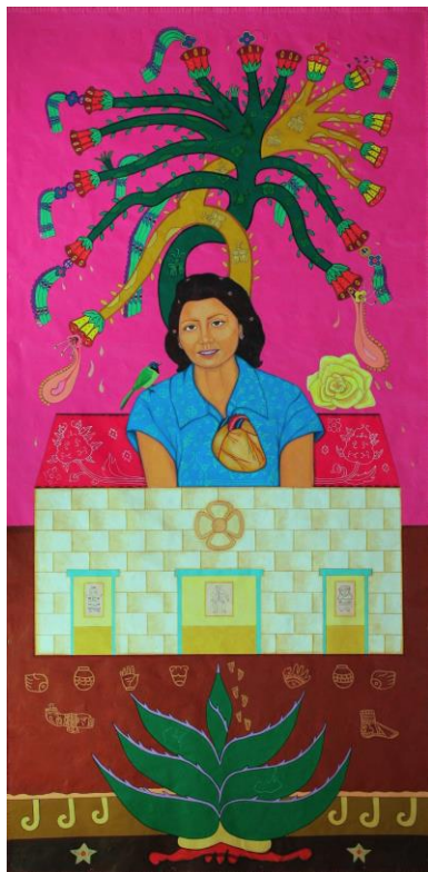
Fig. 2. Santa C. Barraza, Mujeres Nobles Series: Frances con el Arbol de la Vida , 2011. Acrylics on amate paper, 49 1/2 x 97 1/2 in.

MT: Hearing you speak about the significance of the source material that you've drawn upon makes me think about your work and your ability to bring in imagery from Mesoamerican culture and recontextualize it. You bring this imagery to life through your use of color, because we often see the images as inscriptions on stone or black-and-white illustrations. Similarly, in historical photographs, like the Casasola photographs, the historical details often feel very remote, but you bring them forward and integrate them across historical eras. This is especially apparent in your Mujeres Nobles series, in works such as Frances con el Arbol de la Vida , which features your mother (fig. 2). Can you tell me how you approach working with such a rich array of source material?