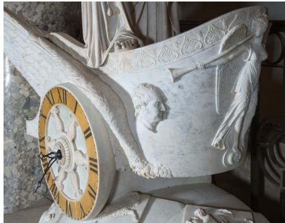
Fig. 5. Carlo Franzoni, Car of History (detail), 1819.

edge of the car, diverges from the frontal, emblematic version Latrobe sketched. Franzoni also eliminated the raised mirror. Although based on classical mythology, the Car of History also includes details that particularize its time and placement, linking it to the nation's founding and to Congress. A profile portrait of George Washington trumpeted by Nike, the goddess of victory, is carved in low relief near the front of the car (fig. 5). The clock face wheel of the car balances on a partial globe adorned with the zodiac signs Sagittarius, Aries, and Aquarius, referencing the months in which Congress typically convened. Time is represented here in not just minutes and hours, but also in days and seasons.