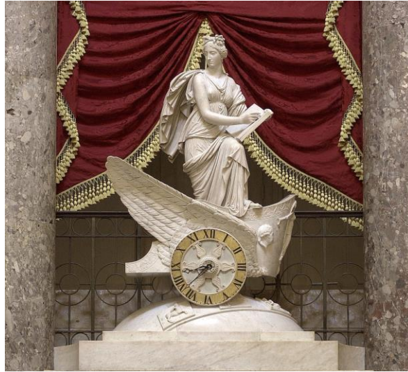
Fig. 3. Carlo Franzoni, Car of History , 1819. Marble, 84 x 66 x 35 in. United States Congress

in a Roman triumphal chariot. Across the chamber, a sculptural group faces her that is thematically similar to the one that had been destroyed by fire. Perhaps the recent devastation of the Capitol in the War of 1812 prompted Latrobe to see the work of Congress from a historical perspective.