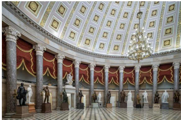
Fig. 1. View of Statuary Hall looking northeast, 2021.

Michele Cohen, Curator, Architect of the Capitol