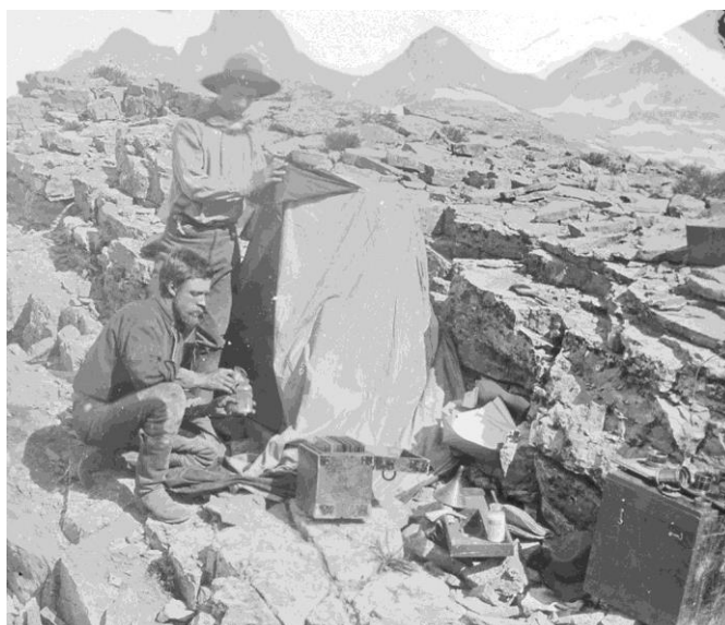
Fig. 3. William Henry Jackson, Photographing in High Places , Lincoln County, Wyoming, 1872 (detail of fig. 2)

Jackson’s photographs of his gear invite broad consideration of how his pictures were collectively produced, taking us beyond a concern with human assistants and pack animals into Jackson’s need for inanimate materials and equipment to also work correctly through unpredictable physical conditions. A detail of Photographing in High Places (fig. 3) shows Jackson mixing chemicals, presumably preparing his collodion—the thick, syrupy mixture produced by soaking guncotton in alcohol and ether mixed with potassium iodide—that needed to be poured onto and evenly distributed across the surface of an absolutely clean glass plate to make a good negative. This step was followed by the sensitizing of the collodion by dipping it in a silver nitrate bath inside a light-proof space (in this case, the small tent shown next to the two men) and the transportation of the negative, while still wet, in a similarly darkened holder to the camera. In addition to the two glass jars being manipulated by the photographer, the image shows an open case of glass plates, a tray with another jar and a funnel laid on top, an open box of paper (possibly the blotting paper that Jackson wet and wrapped around the negatives so they did not dry out in the summer heat before they could be loaded onto the back of the camera), and another case, on the top of which are several camera lenses, including a double lens that could be loaded on top of his camera to produce a stereographic negative.