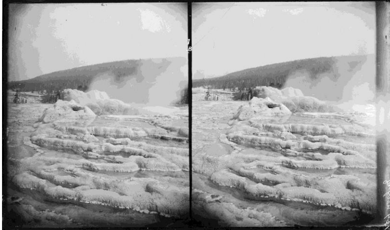
Fig. 4. William Henry Jackson, Crater of Old Faithful . Yellowstone National Park, 1872. Albumen print from plate-glass negative, 3 1/2 x 7 in. National Archives Department of the Interior, General Land Office, US Geological and Geographic Survey of the Territories