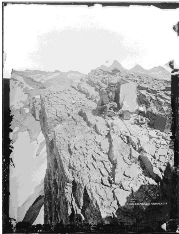
Fig. 2. William Henry Jackson, Photographing in High Places, Lincoln County, Wyoming , 1872. Albumen print from plate glass negative, 4 x 5 in. National Archives Department of the Interior, General Land Office, US Geological and Geographic Survey of the Territories

Much of great value has been said about how the use of landscape conventions in pictures like Jackson’s Three Tetons advanced the interests of white corporate and governmental patrons invested in westward expansion and natural resource extraction. But to engage fully with what survey photographs can teach us, we might turn away from shots that deliver transcendent aesthetic experiences to ones that thematize photographic practice in challenging environmental contexts. Another of Jackson’s photographs, made at the same time, titled by its maker Photographing in High Places, Lincoln County, Wyoming , does just that (fig. 2).