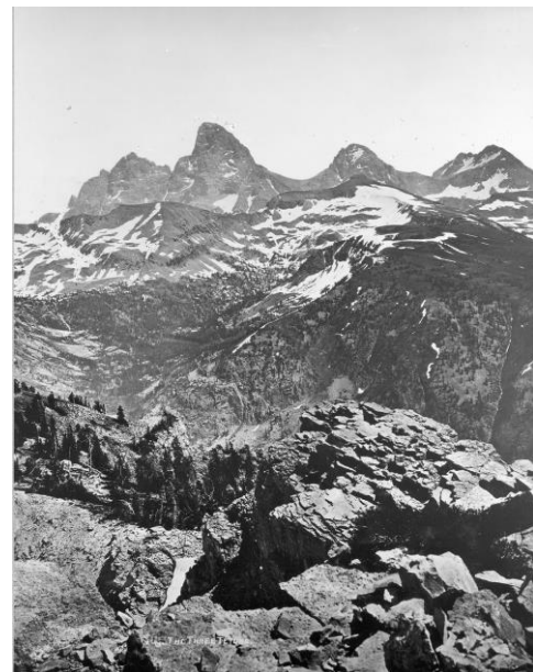
Fig. 1. William Henry Jackson, The Three Tetons. Lincoln County, Wyoming, 1872. Albumen print from plate glass negative, 4 x 5 in.