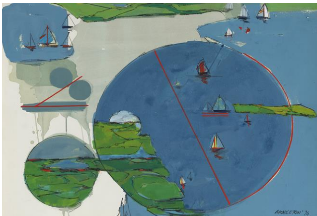
Figure 7. Sam Middleton, Summer Wind , 1976. Mixed media on paper, 20 3/8 x 30 in. Sam Middleton Estate.