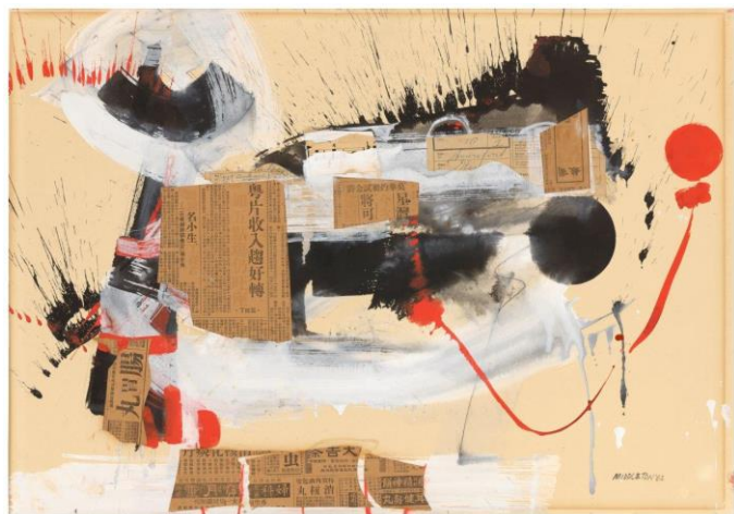
Figure 4. Sam Middleton, Hymn to Democracy , 1962. Mixed media collage on board, 17 1/2 x 25 1/2 in. Collection of Gerald Peters Gallery.

This propensity to script himself, and his work, into a history of modern art and collage, as he understood them, is manifested in the many illustrations of his studio included in the printed materials about his art. Publications of his collages included, from the earliest years onward, photographs of him creating—on the floor, in medias res, and in composed stills of his studio space, evocative of a collage aesthetic. Although some associate collage with creative happenstance, Middleton meticulously regulated his aesthetics and the presentation of his work, such as framing, publications, typeface, and illustrations, and he complained if they