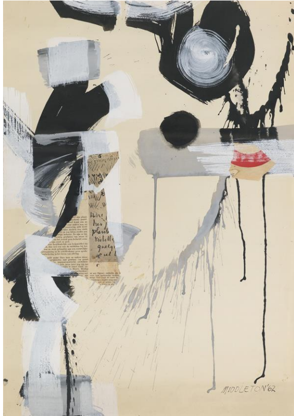
Figure 3. Sam Middleton, Cymbals , 1962. Mixed media on paper, 25 1/4 x 17 3/4 in. Collection of Spanierman Modern, NY. Photography courtesy of Spanierman Modern, NY; © Sam Middleton Estate

Cubism, Surrealism, and Dada are discussed, and noted artists include Marcel Duchamp, Francis Picabia, May Ray, Hans Arp, and Max Ernst. The manuscript, with reference notes and call-outs for illustrations, is methodical and differs markedly from the poetry and unpunctuated prose he also wrote about collage.