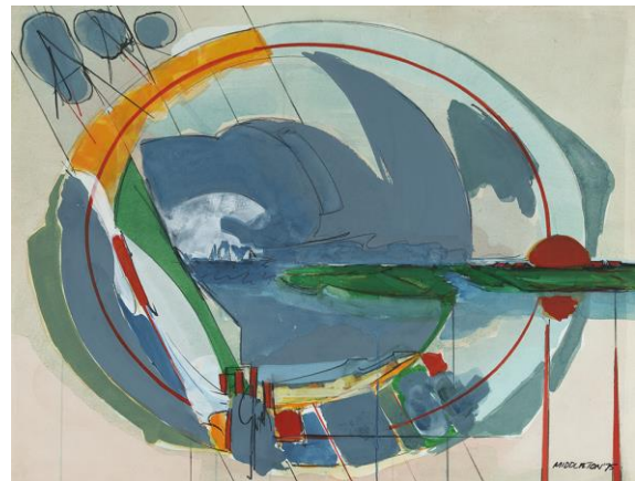
Figure 8. Sam Middleton, Everyone’s Music Book , 1975. Mixed media on paper, 19 1/2 x 25 1/4 in. Sam Middleton Estate.

In a 1974 letter to Romare Bearden, Middleton inquired if he had yet to make art at his new home and studio in St. Maarten, noting: “History has such an obvious influence in the mentality, pride and character of a place and its inhabitants. . . . I can tell you there are some traits, color and expressions that are strictly and def[i]nitely Dutch. They could not ever be Italian, French or Scand[i]navian. Each is individual and so is Art and the artist.” 38 Today we can travel a virtual world instantaneously; Middleton reminds us to consider the place-bound nature of aesthetics, including those attributed to a “European” canon.