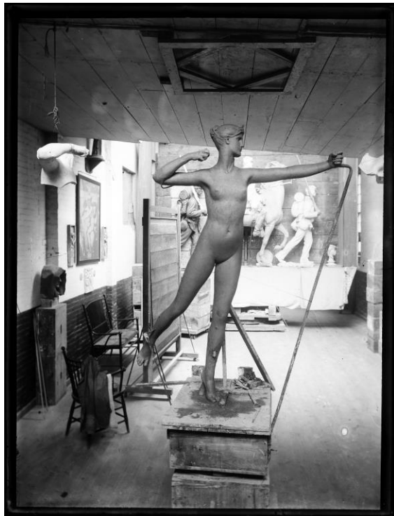
Fig. 4. Photographer Unknown, [View of Saint-Gaudens's Studio], McKim, Mead and White/Museum of the City of New York.

that would indicate whether she was gilded, or painted to look like plaster, or patinated copper or bronze. Perhaps this time around, we would find a fleck of green or a spot of white in a neglected nook or cranny. We had been skeptical about this, and inspection revealed no visible remnants.