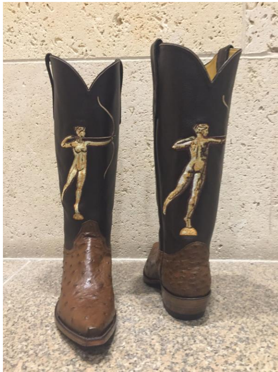
Fig. 1. Photograph of cowboy boots.

I confess to a bit of a Diana fixation. I share one salient commonality with the expert ancient marksman, that is, a history as a competitive toxophilite (lover of archery). As a seasoned archer but a fledgling curator, I would jokingly remark that my preference would be to work for an art museum whose collection included an Augustus Saint-Gaudens (1848–1907) sculpture of Diana—usually a safe bet!