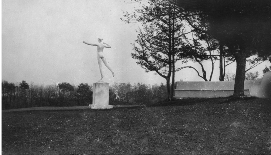
Fig. 5. View of Stanford White's Garden at Box Hill, between 1894 and 1927.

she is similar in color to the cement of the base on which she stands. Combining that visual evidence with the snippet from correspondence, and adding the lack of paint samples that would prove the contrary, we determined that a gray paint color was in keeping with her original appearance.