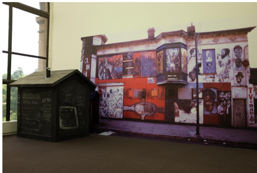
Figure 1. Installation view of Norman Teague, Paper Stand , 2017, wood, paint, tar paper (left) and Bob Crawford, The Wall of Respect , late 1967, photomural, courtesy of Bob Crawford Estate (right).

The curators derived the exhibition from research conducted for a book project entitled The Wall of Respect: Public Art and Black Liberation in 1960s Chicago , which was released after the exhibition closed. 3 I am a contributor to the book; however, I was not involved with the planning of the exhibition. Like the book, the exhibition presents primary documents, photographs, media coverage, and poetic responses that narrate the mural and its reception