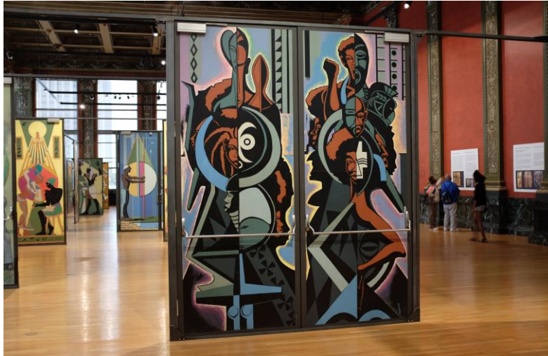
Figure 4. Eugene “Eda” Wade, mural doors from first floor Stairwell C.

Despite their official sanctioning in the halls of civic pride, the radical propositions that these mural projects offer—about community, identity, and resistance—are just beginning to be researched and exhibited. As these exhibitions demonstrate, the challenge to preserve and document such projects is imbedded in the city’s historic processes of uneven development, which sanction some histories while erasing others. That the exhibitions are at the Chicago Cultural Center instead of at one of the city’s more prominent art museums speaks to the tenuous place that some of Chicago’s most important black artists have in the history of the city and in twentieth-century art more broadly.