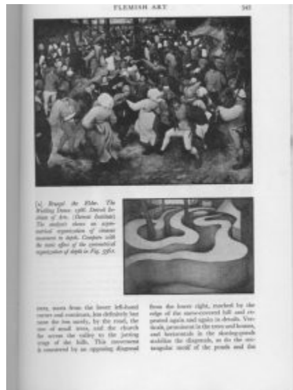
Fig. 1. Figure 543a in Helen Gardner, Art Through the Ages (New York: Harcourt, Brace, 1948), 543.