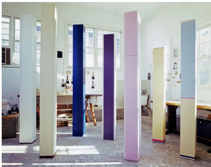
Fig. 6. Anne Truitt's 35th Street Studio in 1979.

Truitt is preoccupied with how color and form interact to create a dynamic lifting effect. To achieve it, Truitt often uses narrow bands of contrasting colors that wrap around a figure near its top or bottom (fig. 6). In architectural terms, these bands of color are ornaments rather than dispensable decorations, 16 playing an integral role to Truitt's method. Mid Day (1972; NGA) offers the best example. At its base, two adjoining bands of black and light brown give the bright red sculpture an electric charge so that the red hue, evoking the intensity of the noon sun, bolts toward the sky to a height of ten feet. A related effect in different tonalities characterizes Summer Remembered . A zigzagging dark blue band encircles the thin yellowish sculpture, vaulting it upward. The most elusive ornament appears in Twining Court II (2002; John and Mary Pappajohn Collection), a slender, austere black sculpture. A quarter-inch from the top, a thin black protrusion encircles the work. It is visible only at close range, and its meaning and function are difficult to divine.