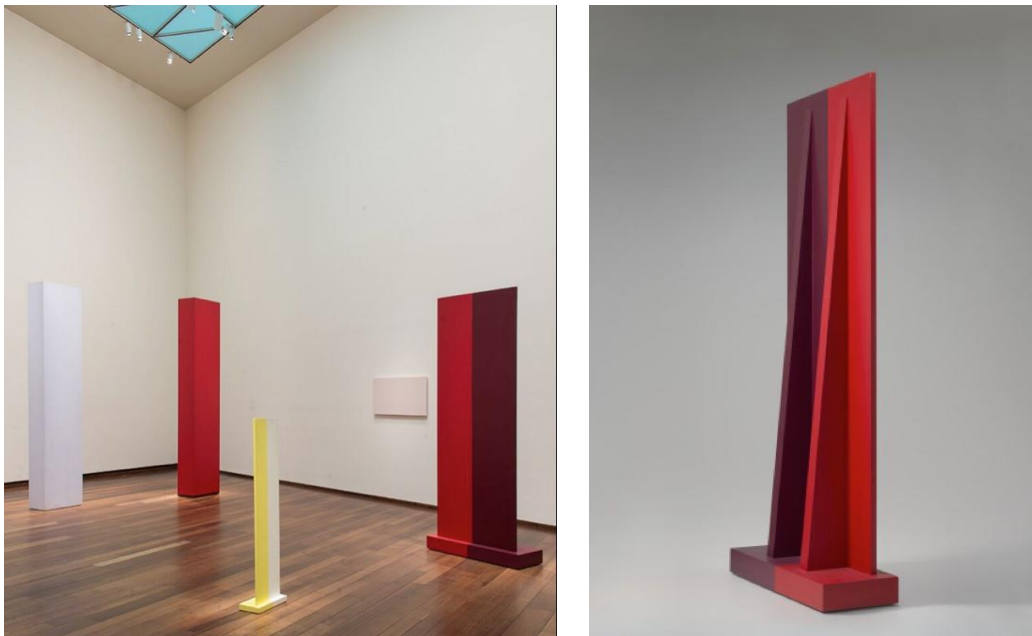
Figs. 4, 5. Left: Anne Truitt, Spume, Mid Day, Mary's Light, Sand Morning (canvas), Insurrection (left to right); photograph courtesy of National Gallery of Art, Washington, DC. Right: Anne Truitt, Insurrection , 1962. Acrylic on wood, 100 1/2 x 42 x 16 in. Collection of the National Gallery of Art, Washington, DC; photograph courtesy of National Gallery of Art, Washington, DC

The works on display highlight Truitt's ambivalent relationship to trends in Minimalism while emphasizing the movement's heterogeneity. When it comes to spareness of form, reduction of art to its essentials (shape, color, line), and the turn away from representation, Truitt's work falls squarely within Minimalism's ambit (fig. 4). Yet in other ways, her art accentuates fault lines in the movement. In overall effect, choice of materials, and compositional approach, her art aligns with Carl Andre's sensibilities far more than Donald Judd's penchant for sleek monochromatic finishes or Dan Flavin's inclination toward playful industrial chic. Both Andre and Truitt accentuate uneven textures. But whereas the rich variability in Andre's wooden sculpture is usually pronounced—as in Last Ladder (1959; Tate Gallery)—in Truitt's works, ineffable complexities are expressed through variations in layering and shading on a micro scale.