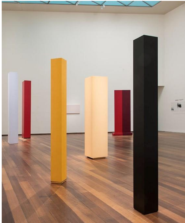
Fig. 1. Installation view, main gallery of In the Tower: Anne Truitt , National Gallery of Art, Washington, DC

Reviewed by: Mark L. Hanin, Art Writer and Law Clerk, Court of Appeals for the District of Columbia Circuit, Washington, DC