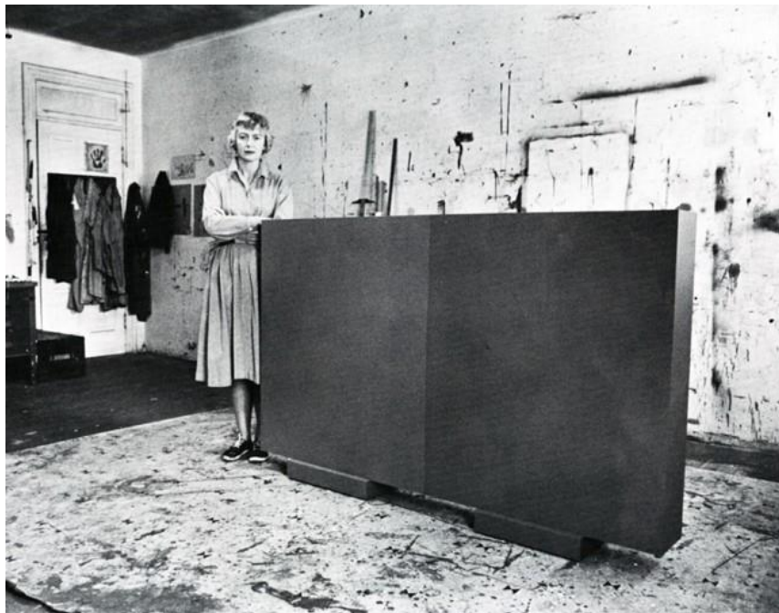
Fig. 8. Anne Truitt in Twining Court Studio (1962).

Truitt's deceptively plain sculptures invite us to do the hard work of really seeing, a much-needed skill in today's distraction-prone culture. In her art we confront alien, magnetic, self-sustaining objects (fig. 8). While they are refined aesthetic works, they refer us back to elemental processes in nature via the interplay of movement, light, and emotional vibrancy. The exhibition makes a case against reductive narratives of Minimalism and convincingly demonstrates how the organic and the individual can be preserved, improbably and subtly, in Minimalist garb. 18