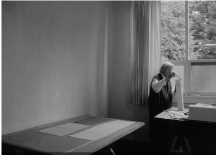
Fig. 7. Still from Jem Cohen, dir. Anne Truitt, Working (2009), an interview and 16mm footage made in and around her studio at the Yaddo artist colony and from her home studio in Washington, DC. For a screening of the film at a public symposium held at the National Gallery on January 19, 2018, visit https://www.nga.gov/audio-video/truitt-symposium/truitt-partiii-video.html

Truitt's fascination with vertical movement comes through clearly in Jem Cohen's documentary in the second gallery (fig. 7). Filmed in 1999 at Yaddo, the artists' community in upstate New York where Truitt had a long association, it shows Truitt amid jars of paint, brushes, and half-finished sculptures in her studio. Truitt's sensibilities and idiosyncratic turns of phrase—like “sickish color” and feeling “springy on our feet”—offer clues to reading her works. She describes her art-making process and narrates her ways of selecting and blending hues so that color “zooms into being” to enliven a sculpture. “As you walk around it the whole thing vibrates. It sings. It moves. It moves as the light moves.” 17 This sense of dynamism and vitality expressed in sculptural form and made vivid up close sets Truitt's work apart from that of other Minimalists.