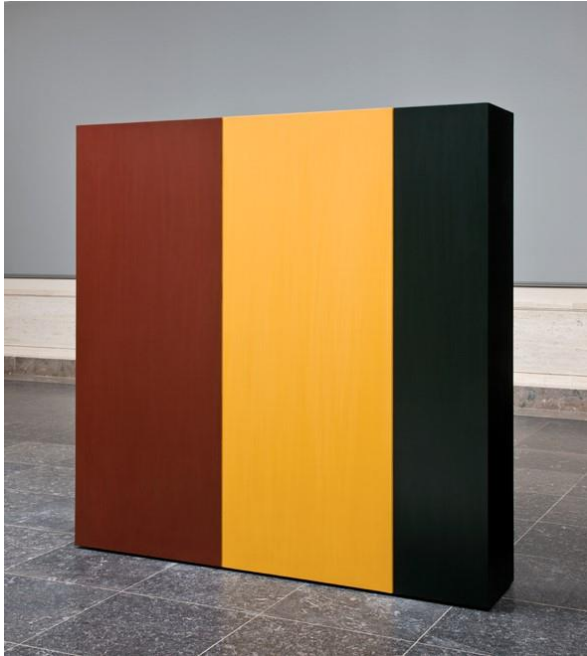
Fig. 2. Anne Truitt, Knight's Heritage , 1963. Acrylic on wood, 60 3/8 x 60 3/8 x 12 in. Collection of the National Gallery of Art, Washington, DC; photograph courtesy of National Gallery of Art, Washington, DC.

For Truitt, the organic and living are paramount, despite a lack of representational content. She seeks an atmosphere of “aliveness,” so colors “won’t settle.” 12