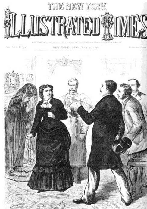
Figs. 1, 2. Left: Photograph of Anthony Comstock, Originally published in Anthony Comstock, fighter: some impressions of a lifetime of adventure in conflict with the powers of evil (1913) by Charles Gallaudet Trumbull. Right: Figure 2. “The arrest of abortionist Ann Lohman (a.k.a. Madame Restell) by Anthony Comstock,” from the 23 February 1878 edition of the New York Illustrated Times.