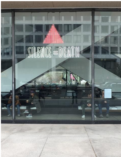
Fig. 3. Installation of ACT UP (Gran Fury), Silence = Death , 1987, in Brand New: Art and Commodity in the 1980s at the Hirshhorn Museum and Sculpture Garden, Smithsonian Institution, 2018.

Also unclear is the gallery organized around a theme of "Political Activism." The gallery contains Erika Rothenberg's Freedom of Expression Drugs (1989), a display of packaged products such as Protest Pills and Anti-Apathy Ointment, and Krzysztof Wodiczko's Homeless Vehicle, Variant 5 (1988–89), a mobile shelter providing security and autonomy for its users in order. As works responsive to the insidious effects of corporate takeovers of both space and citizenship, these works are comfortably paired. Without its optional pendant painting, Sherrie Levine's Ignatz: 6 (1988) offers an opaque comment. Wall text elliptically explains that the painted Krazy Kat figure, depicted as having just thrown a brick, "both inspires and houses social desires and hopes" and "encapsulates the tragicomedy of our relationships with objects." Does Jetzer intend for audiences to puzzle over this work, a sign of violence without weapons, as an attack without argument? Is it a comment on protest in a world saturated by commodities? Are we meant to read this as illuminating or tamping down the influence of the works not only surrounding but preceding it? After exiting a gallery papered in Donald Moffett's He Kills Me (1987; International Center of Photography) and Gretchen Bender's continuously broadcasting Untitled (People with AIDS) (1986; courtesy of the Gretchen Bender Estate and OSMOS) (fig. 1), how should we understand the framing of Levine's work as "political activism"?