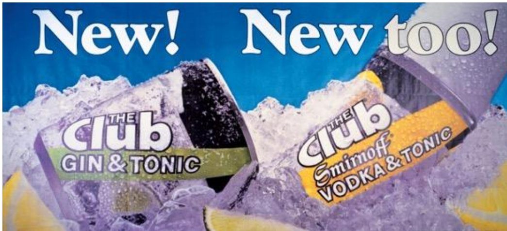
Fig. 2. Jeff Koons, New! New Too! 1983. Lithograph billboard mounted on cotton, 123 x 272 in.

Artists engaging a product-driven culture populate the exhibition galleries. Dara Birnbaum’s Remy/Grand Central: Trains and Boats and Planes (1980), commissioned by the cognac retailer and shown in the New York City terminal, plays in the same gallery as Peter Halley’s Pepsi Please (1980) hangs, a painting of a ghoulish figure captioned by the title of the work. General Idea’s dollar sign-shaped The Boutique from the 1984 Miss General Idea Pavilion (1980) is overloaded with gift shop-type memorabilia. Walter Robinson’s painted still life Lube Landscape (1985), Haim Steinbach’s shelf of detergent boxes and ceramic pitchers, supremely black (1985), and David Wojnarowicz’s painting on a supermarket poster, USDA Choice Beef (1985) mine the vocabulary of contemporary advertising and product design. Gretchen Bender’s Dumping Core (1984) intercuts the logos of television networks and car companies with news footage and clips of the Statue of Liberty across thirteen video monitors to a thrumming synthesizer and percussion soundtrack. Stripping away coded messaging, Jennifer Diamond’s T.V. Telepathy (Black and White Version) (1989; courtesy of the artist) fills a gallery wall, directing viewers in bold black lettering to “Eat Sugar” and “Spend Money” (fig. 1).