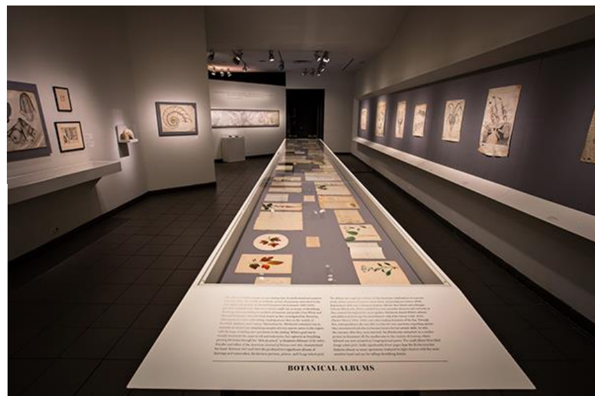
Fig. 1. Installation view of Charting the Divine Plan: The Art of Orra White Hitchcock (1796–1863) . American Folk Art Museum, New York, June 12–October 14, 2018.

In post-Revolutionary New England, botany was one of the few areas of study that educated classes considered suitable for women. As the field increased in popularity at the turn of the eighteenth century, the number of introductory texts on botany multiplied, as did the emphasis on botanical illustration. The Massachusetts woman Orra White Hitchcock was an important figure among the small but impressive number of female botanical illustrators who flourished at this time. As was typical of the time, Orra primarily worked as an assistant for her husband, the scientist Edward Hitchcock, creating watercolor renderings of orchids, carnations, and violets that supported his field research in the natural sciences. These colorful floral sketches were recently the highlight of the exhibition Charting the Divine Plan: The Art of Orra White Hitchcock (1796–1863) at the American Folk Art Museum in New York (fig. 1). With its rich presentation of biographical material, including poems and personal letters, Charting the Divine Plan effectively situated Orra as a woman who found a way to create visual works while complying with expectations of female modesty and affability of the early republic.