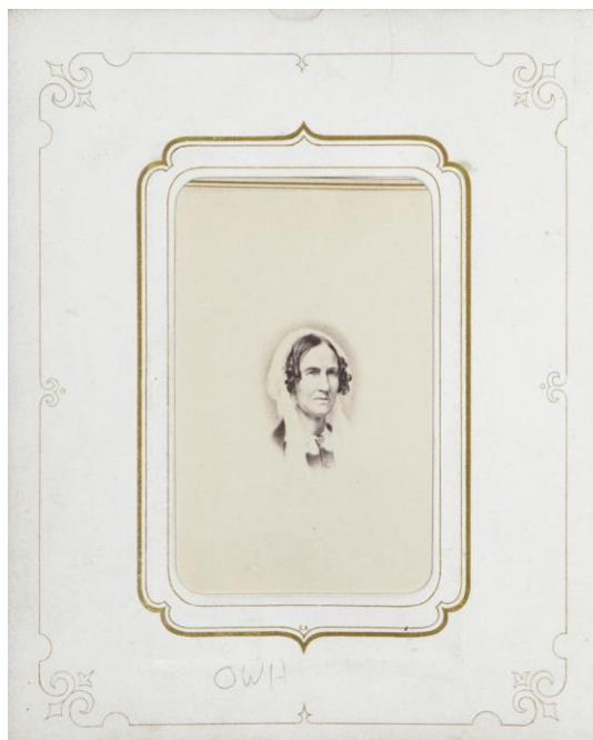
Fig. 2. Photograph of Orra White Hitchcock, "Hitchcock family photo album." A photograph album featuring cartes de visite of various members of the Hitchcock family, 1800–99. Box 24 folder 28, Edward and Orra White Hitchcock Papers, Amherst College Archives and Special Collections

The exhibition was dedicated to Orra in name; however, it was her marriage to Edward that ultimately formed the central focus of the show. The museum devoted one full gallery to exhibiting fossils discovered by Edward and another to illustrations by Orra for his lectures on geology, and several wall labels also give lengthy accounts of Edward's pedagogical work and chronic hypochondria. In the press release, likewise, the curator Stacey Hollander places the relationship of Orra and Edward in the foreground, describing their union as a "friendship and collaboration based on a bedrock of faith and science, mutual respect, close observation, and mental capacity for the largest of ideas." 1 This statement, and the overall emphasis on Edward, gave a false impression that the marriage of Orra and Edward was thoroughly egalitarian. In fact, the exhibition referenced a period when the rights of married women were grossly limited. An example of the power imbalance in their marriage can even be found in Edward's memoirs when he describes Orra's willingness to work without pay: "Mrs. Hitchcock," Edward writes, labored steadily "for thirty-six years, whenever called upon to supply my numerous demands [ . . . ] without the slightest pecuniary compensation, or the hope of artistic reputation." 2