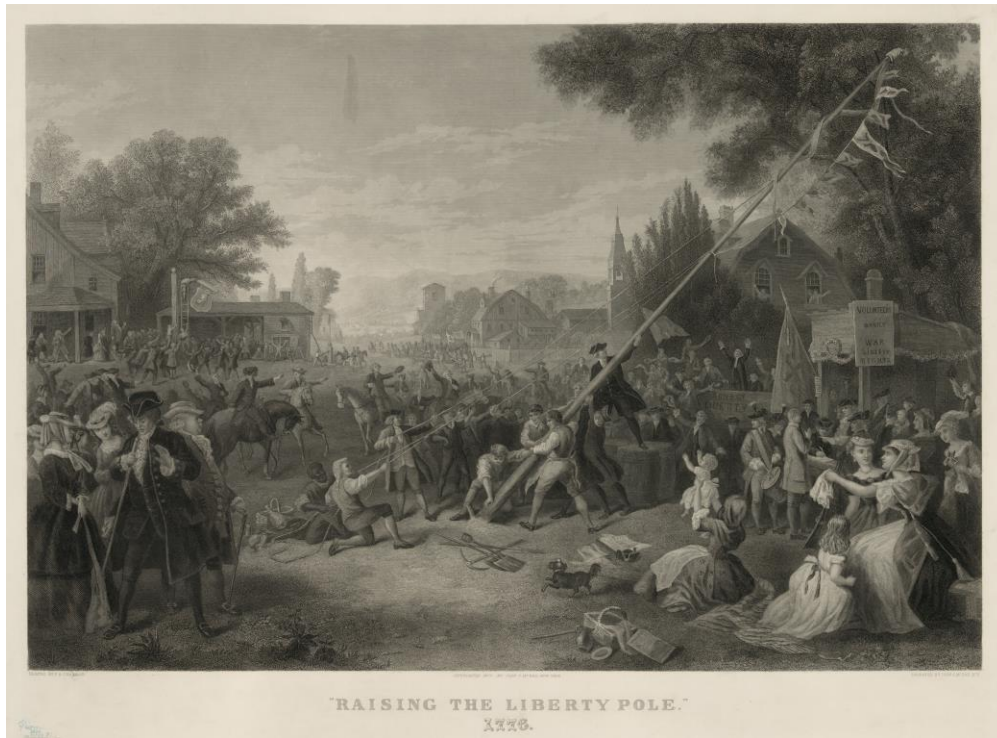
Fig. 2. John C. McRae, after F. A. Chapman, Raising the Liberty Pole , 1776, c. 1875. Etching and engraving, 26 x 36 in. Library of Congress, Washington, DC. Prints and Photographs Division

applications within current debates and spaces. In noting the physically unremarkable yet enduring presence of a Liberty Flagstaff in City Hall Park, New York, illustrated as a final image in Bellion's text, the author connects past practices to any number of contemporary events that call for courage and resistance, some of which are sited in the park.