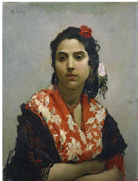
Fig. 7. Raimundo Madrazo, Una gitana ( A Gypsy ), 1872. Oil on canvas, 26 x 19 5/8 in. Inscribed upper left: R. Madrazo . Museo Nacional del Prado, Legacy of Ramón de Errazu y Rubio de Tejada

Whereas Barrera, an amateur painter a generation older than his young friend from Philadelphia, worked in a traditional costumbrista manner, Cassatt was moving toward the more naturalistic and cosmopolitan trends of Paris. Barrera wrote