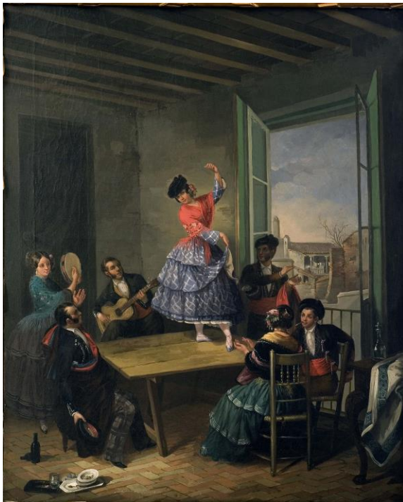
Fig. 6. Manuel Barrera, Danza en un interior ( Dance in an Interior ), 1854. Oil on canvas, dimensions unknown. Inscribed lower left: Manuel F. Barrera/1854 . Private Collection, Seville

Manuel Barrera Haedo (active 1849–1876) is indeed a marginal figure in the history of Spanish painting. 9 Listed in the Madrid periodical El Clamor Público as exhibiting in the