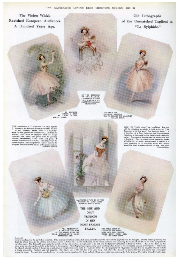
Fig. 5. Page from The Illustrated London News , Christmas Number, 1941–22, the same page owned by Joseph Cornell. Box 26, Folder 2, Joseph Cornell Papers, 1804–1896, bulk 1939–1972, Archives of American Art, Smithsonian Institution.

June 1945. 20 A few issues of Dance survive in Cornell’s library and archives, including one from July 1945. 21 Cornell expertly intertwines Taglioni and Moore, ballet women dedicated to bringing the past of the art to the present, connecting Cornell, as audience-artist, to performers in the nineteenth century and beyond. As was typical for him, he coalesces his referents. The Sylphide is Taglioni and Taglioni is the Sylphide, and perhaps all other dancers who performed her role are, too.