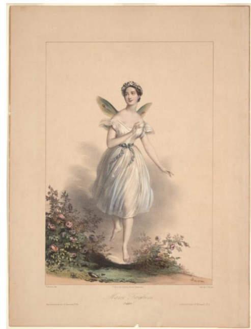
Fig. 4. Charles Etienne Pierre Motte, after Achille Devéria, Marie Taglioni (Sylphide) , c. 1830–39. Colored lithograph, 13 3/4 x 9 1/2 inches. Jerome Robbins Dance Division, The New York Public Library for the Performing Arts.

The 1949 reliquary memorializes a dying kind of narrative ballet through a particular figure, the tragic Sylphide. Since Cornell does not include an article—"La" or "Les"—the box can refer to both to the 1832 Romantic ballet La Sylphide , made famous by Marie Taglioni, and the 1907 ballet blanc Les Sylphides , choreographed by Mikhail Fokine. The foundational 1832 Romantic ballet was often illustrated in the prized lithographs which Cornell and other balletomanes collected (fig. 4). 18 In some lithographs of Taglioni, the ballerina wears the flowing, ankle-revealing tutu that she popularized, with a blue ribbon emphasizing her waist. 19 Moore would have immediately thought of the earlier dancer; she translated Taglioni's letters for the magazine Dance in